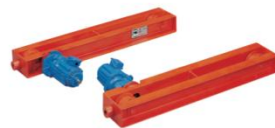
Top Running Channel Type